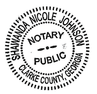
Notary Public My Commission Expires: